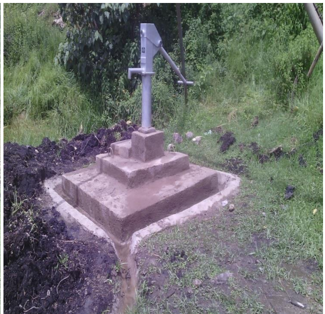
The views of the completed hand dug well construction