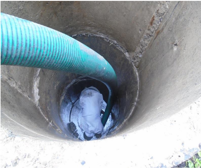
The progress of hand dug well construction over time

The completion of these hand dug well construction has made promising results in education status of children living in poverty at the project area. As a result of this hand dug well construction, the teachers are also highly encouraged to stay and school due accessing drinking water at any time they need. Additionally the PTAs are also very happy because of their students are accessing potable water at the school compound. Constructed hand dug well project will benefit 227 children (50% of female).